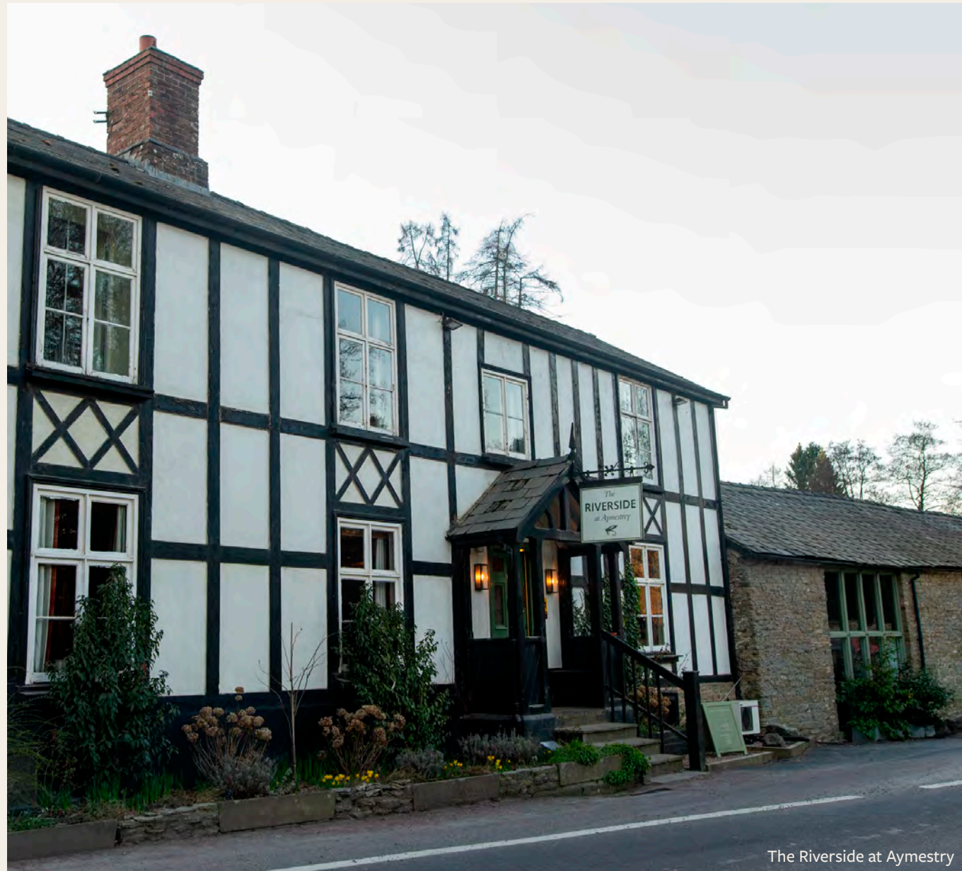
The Riverside at Aymestry

We recommend booking well in advance to avoid disappointment.