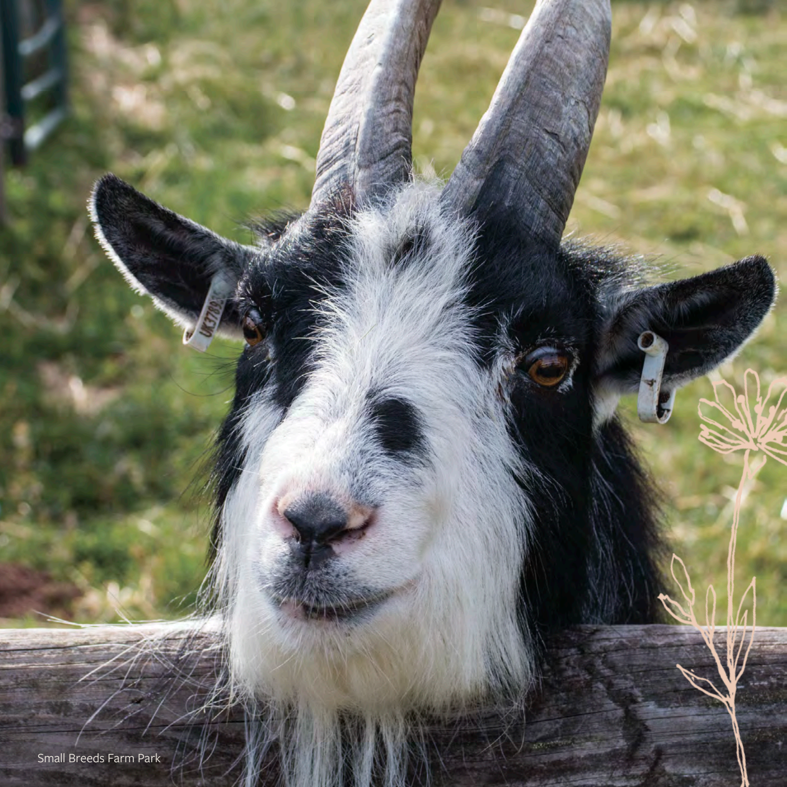
Small Breeds Farm Park