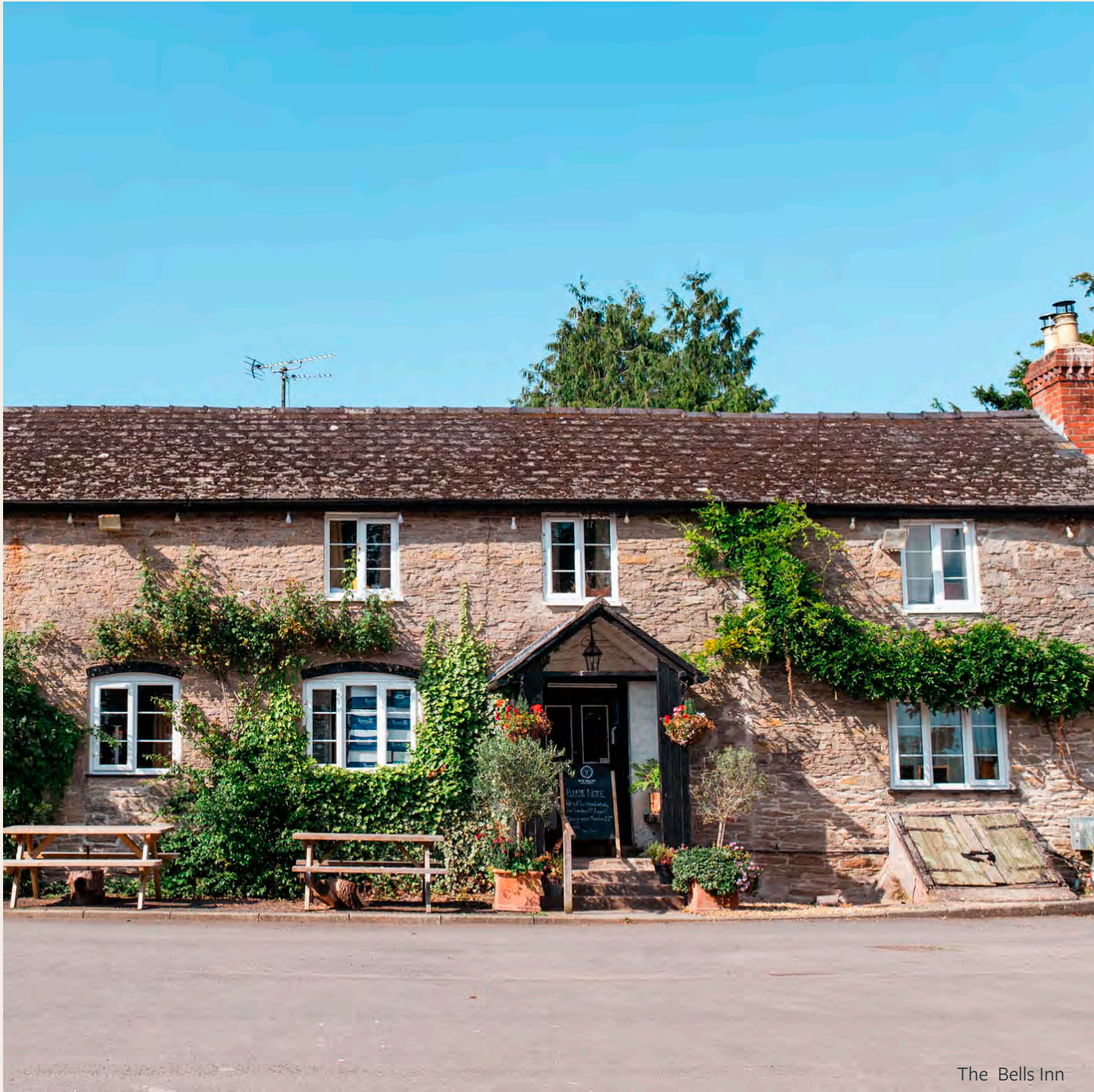
The Bells Inn