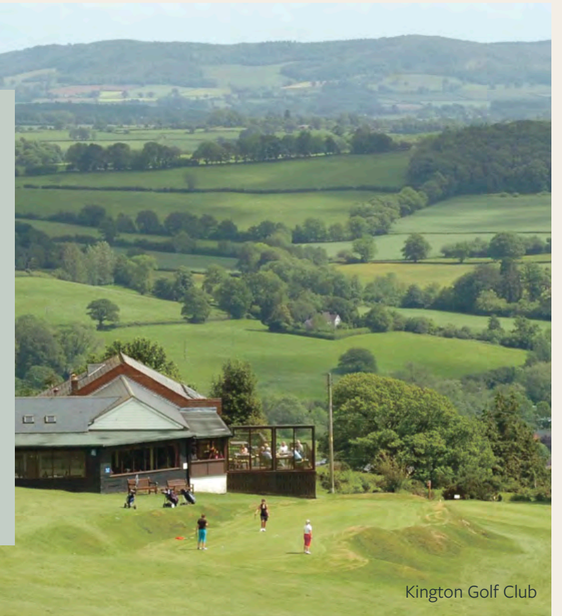
Kington Golf Club

Grove Golf & Bowl - Great golf, exciting bowling in the heart of Herefordshire. Tel: 01568 610602, www.grovegolfandbowl.co.uk