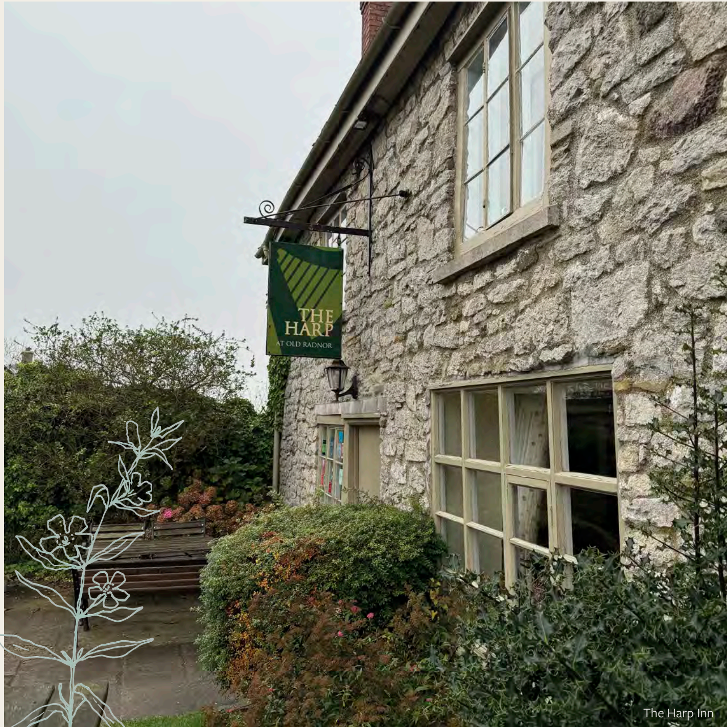
The Harp Inn