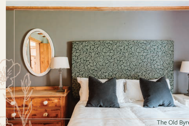
The Old Byre