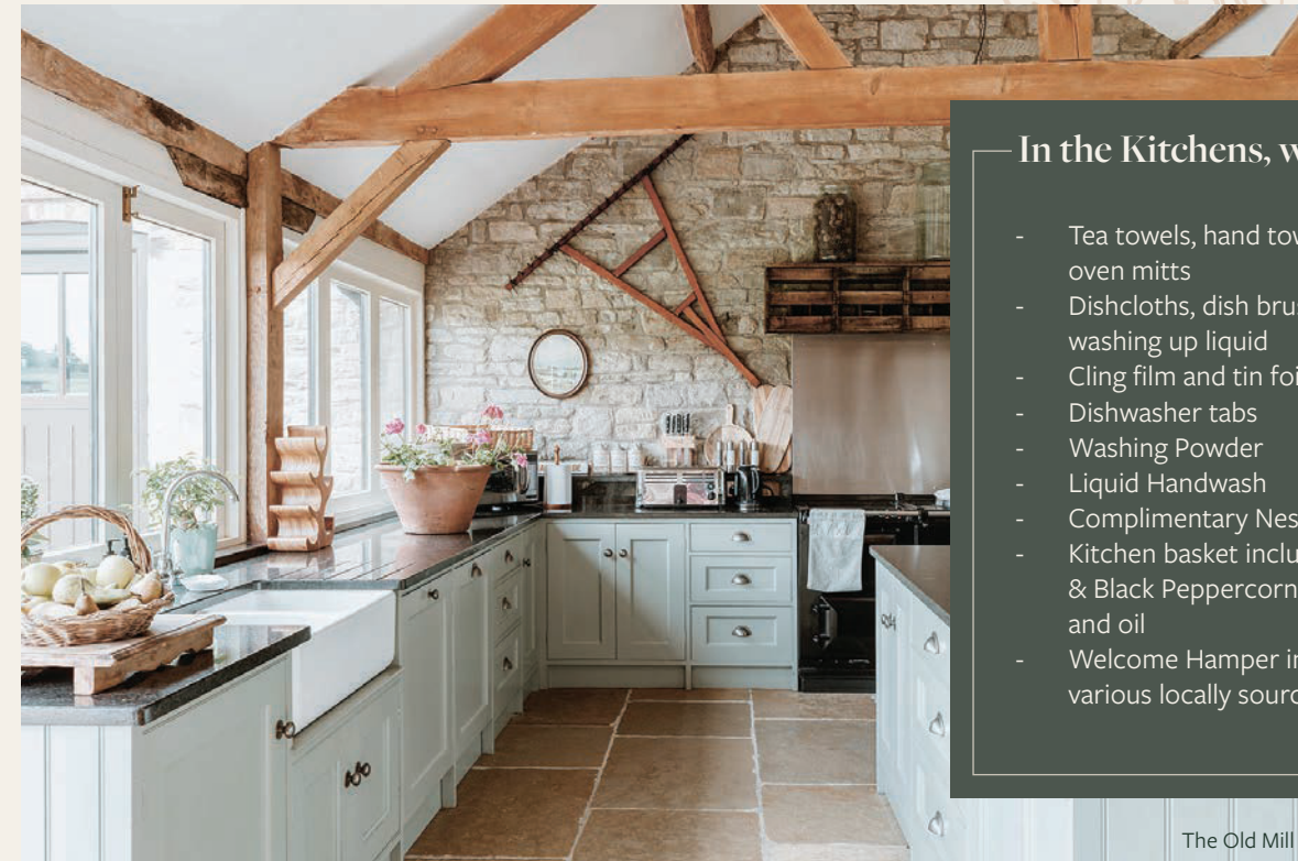
The Old Mill